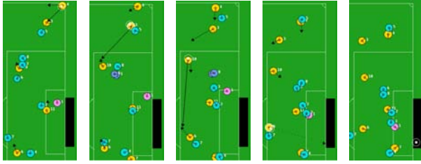
Fig. 2: Game scenes of an extracted corner-kick goal plan with 4 participants. The black, blue and red arrows represent player action: a pass, run and shoot at goal respectively.

these actions allowed the team to set its teammates free in order to receive the ball and have a clear shot at goal in situations without significant opponent’s pressure.