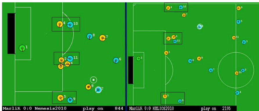
Fig. 4. Play_on mark against different teams.

After adding this skill to our team, the power of our defense increased a lot and now most of the teams can hardly score a goal against us. This type of defending works on almost all teams' offense systems and it's more stable than our previous defense system.