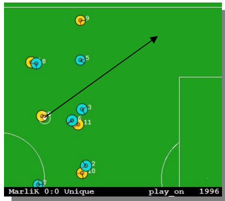
Fig. 2. Through pass executed and lead to a goal.

An example situation is shown in the below picture in which our old through pass skill wouldn't manage to identify the through passing possibility but the new through pass skill managed to do the pass and it resulted in a goal.