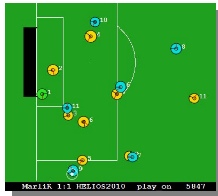
Fig. 3. Cross marking execution against HELIOS2010.

This type of marking is planned for the time when an opponent player reaches near one of the corner flags in our field and a cross can be dangerous for our team. So with a zonal marking system we try to mark all the attackers with our defenders in order not to give any chance of passing to the ball owner so the blocking defender has more time to block him and stop the attack. In this type of marking, markers will stick to the target attacker and stand between the ball and the opponent to reach the ball faster than him when it is crossed. After executing this mark we have tested it against the world's most powerful teams such as HELIOS and after debugging and optimizing this skill, different situations were tested. If the number of attackers is less than our defenders, man-to-man marking will be executed and the other defenders will guard against our goal to block probable shots and if attackers are more than our defenders, our offensive midfielders will join defense and mark opponents if they have enough stamina. A result of this marking system against team HELIOS2010 can be seen in this picture.